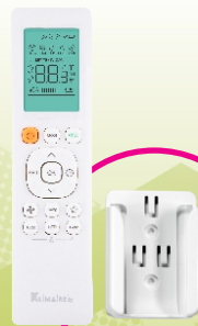
Remote Control Holder